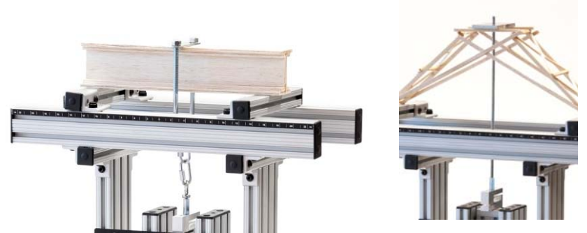
The beam on the left is secured using a U-bolt and quick links while the structure to the right is secured using a threaded rod attached to a metal loading plate.

Once the structure or beam is secured in place with the appropriate tackle, connect the VSMT Force and VSMT Displacement Sensors to an interface. Open the appropriate experiment file if using Logger Pro . Zero the sensors and start data collection. Turn the displacement wheel in the direction of the arrows (counter clockwise) and the Force Sensor travels down, applying a force to the structure or beam via the tackle. The VSMT Force Sensor registers the force while the VSMT Displacement Sensor tracks how far the structure has been deflected, bent, or stretched.