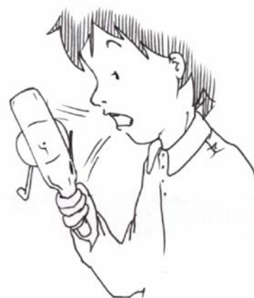
Fig. 2 Humidifying the Unit when the air is dry