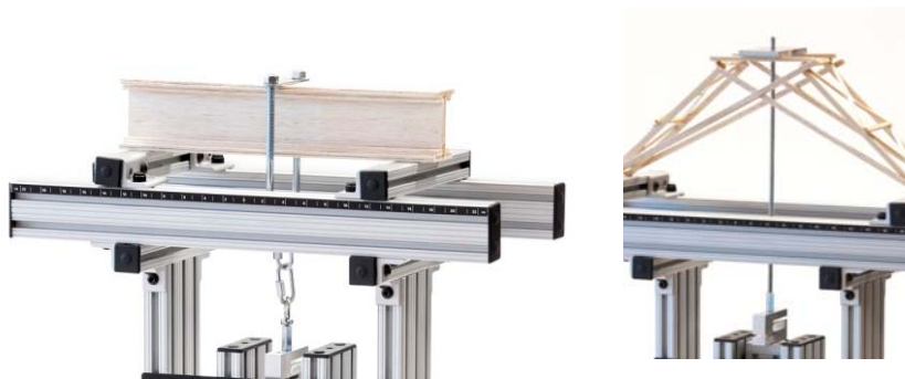
The beam on the left is secured using a U-bolt and quick links while the structure to the right is secured using a threaded rod attached to a metal loading plate.

Once the structure or beam is secured in place with the appropriate tackle, connect the VSMT Force and VSMT Displacement Sensors to an interface. Open the appropriate experiment file if using Logger Pro . Zero the sensors and start data collection. Turn the displacement wheel in the direction of the arrows (counter clockwise) and the Force Sensor travels down, applying a force to the structure or beam via the tackle. The VSMT Force Sensor registers the force while the VSMT Displacement Sensor tracks how far the structure has been deflected, bent, or stretched.