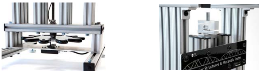
The VSMT Displacement Sensor is mounted below the wheel. Turning the wheel pulls the Force Sensor down, applying a force to the structure above.

Once the structure or beam is secured in place with the appropriate tackle, connect the VSMT Force and VSMT Displacement Sensors to an interface. Open the appropriate experiment file if using Logger Pro . Zero the sensors and start data collection. Turn the displacement wheel in the direction of the arrows (counter clockwise) and the Force Sensor travels down, applying a force to the structure or beam via the tackle. The VSMT Force Sensor registers the force while the VSMT Displacement Sensor tracks how far the structure has been deflected, bent, or stretched.